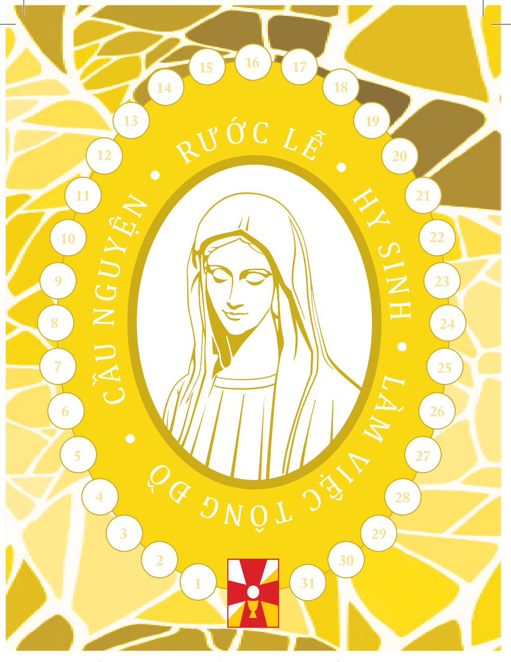
BÓ HOA THIÊNG | THÁNG 10