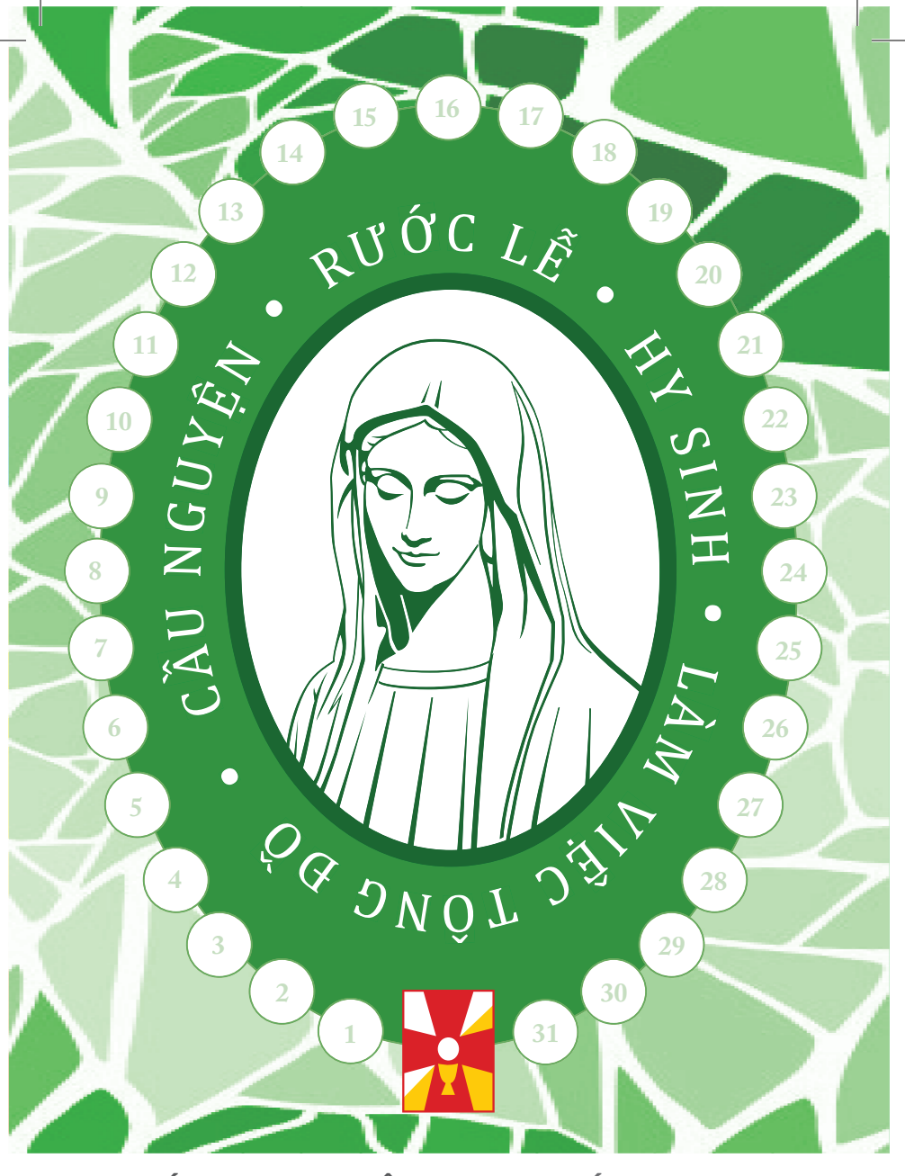
BÓ HOA THIÊNG | THÁNG 10