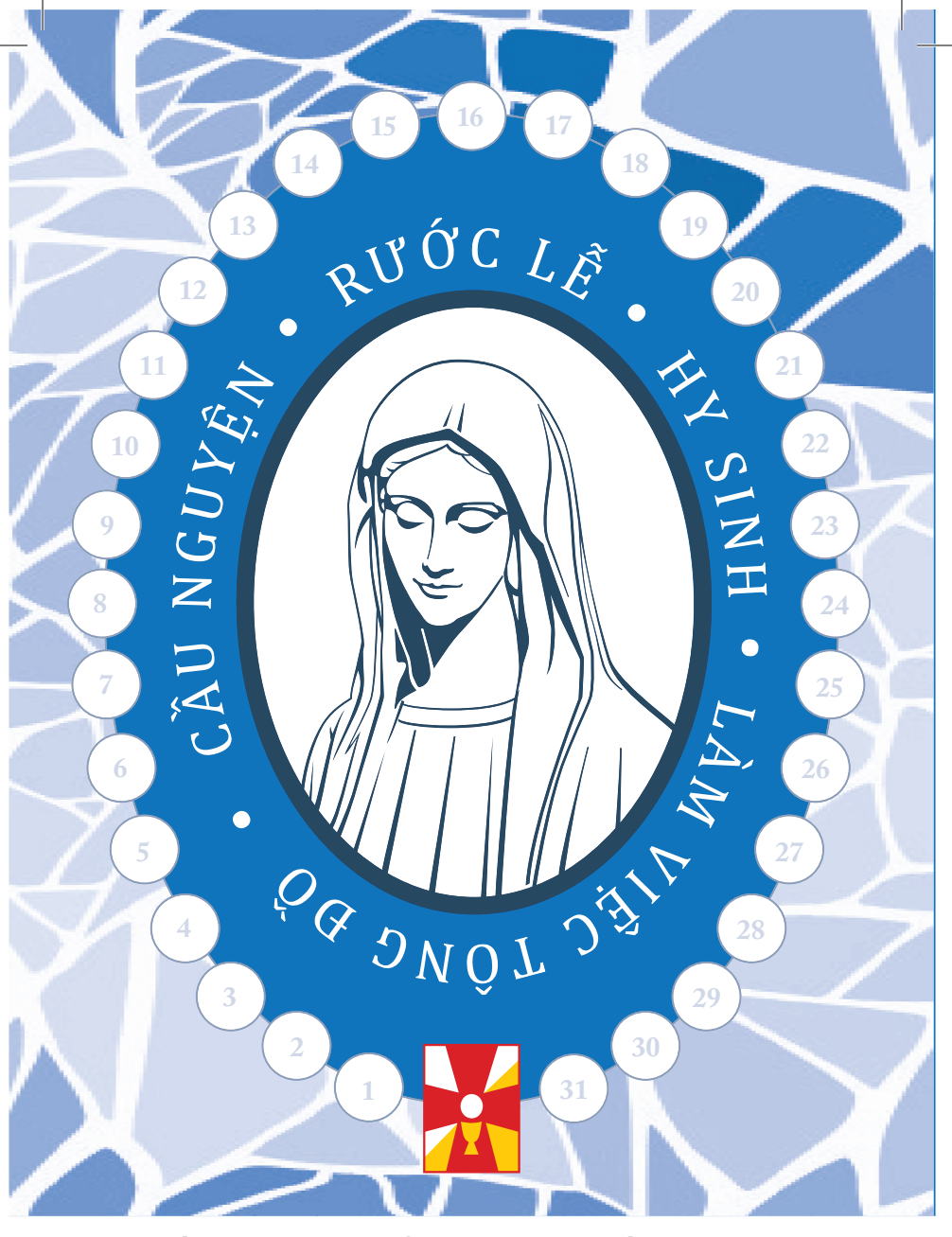
BÓ HOA THIÊNG | THÁNG 10